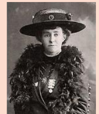
Emily Wilding Davison - WSPU