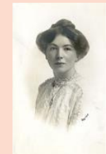
Christabel Pankhurst - WSPU