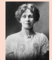
Emmeline Pankhurst – WSPU