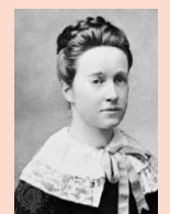
Millicent Fawcett - NUWSS