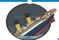
Titanic sinks (1912)

Members of the union were given the nickname 'The Suffragettes' (suffrage meaning the right to vote).