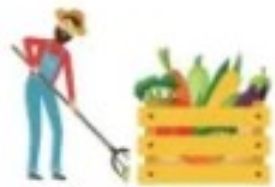
Farming and Harvesting