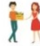
Consumer buys from the market