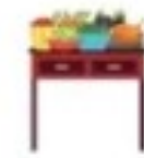
Meal is ready!